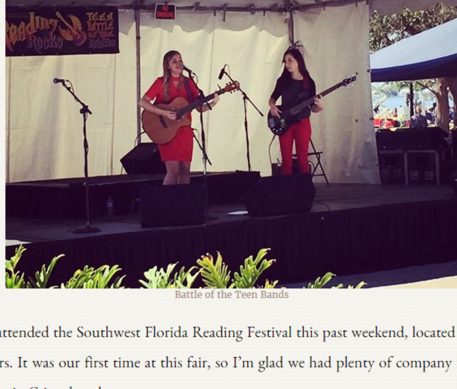
Battle of the Teen Bands

We attended the Southwest Florida Reading Festival this past weekend, located in Ft. Myers. It was our first time at this fair, so I'm glad we had plenty of company in the Sisters in Crime booth.